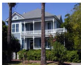
Isidore Predecki House

22 Rosenberg (25th) - c. 1903, Queen Anne, modified [unclear]. Typifies the generous porches of the century residences in the district following the Great Storm of 1900.