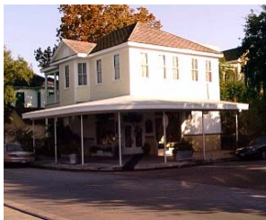
Irving Residence and Viani Corner Store