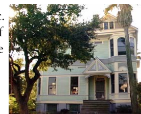
The Hickenlooper House

44. 2327 Avenue M - c. 1893, the eclectic blend of ornamentation typifies the varied interpretation of the Queen Anne style. Lucy Hickenlooper grew up in the house and later achieved international recognition as a concert pianist under the name of Madame Olga Samaroff.