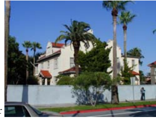
Daniel Webster Kempner House