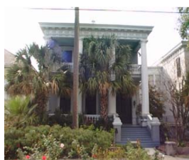
1405 24th Street