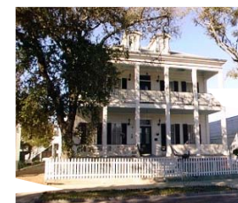
Charles Adams House

46. 2314 Avenue M - c. 1860, vernacular center passage form. In 1921 the house was turned from the original 23rd Street frontage to face Avenue M to escape the commercial redevelopment along 23rd.