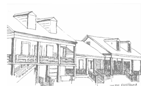
African American Rental Cottages

47, 48, 49. 2326 - 2318 Avenue M - c. 1870, Gulf Coast cottages, represented the integrated housing conditions that characterized the neighborhood for much of its history. There were structures on these lots in 1865 with additions made in 1870. The houses were moved close together at some time to accommodate the small houses on the west corner.