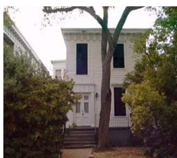
1401 24th Street

25, 26. 1405 and 1401 24th Street - George Ball House - c. 1857/1901, two story dwelling originally consisted of a side hall form and rear ell graced by Greek Revival style ornamentation. Originally built at 23rd and Sealy. Moved to current location in 1901 to make way for development of the Rosenberg Library. Primary portion of home was moved to 1405 24th Street and the rear ell was moved to 1401 24th Street.